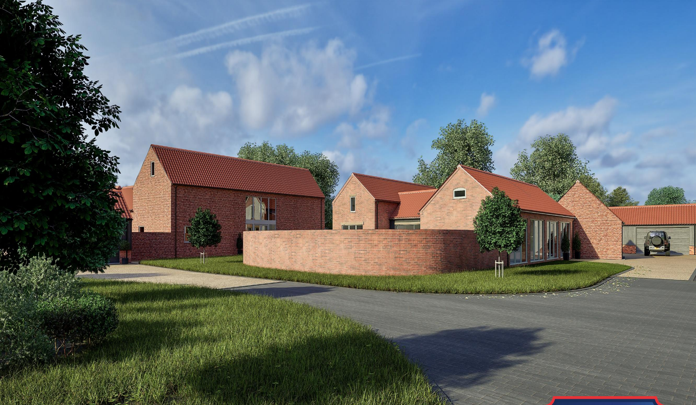
Manor Farm – Barns 1 & 2 Sand Lane, Spalford, Newark, Notts. NG23 7HF